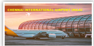
Chennai International Airport